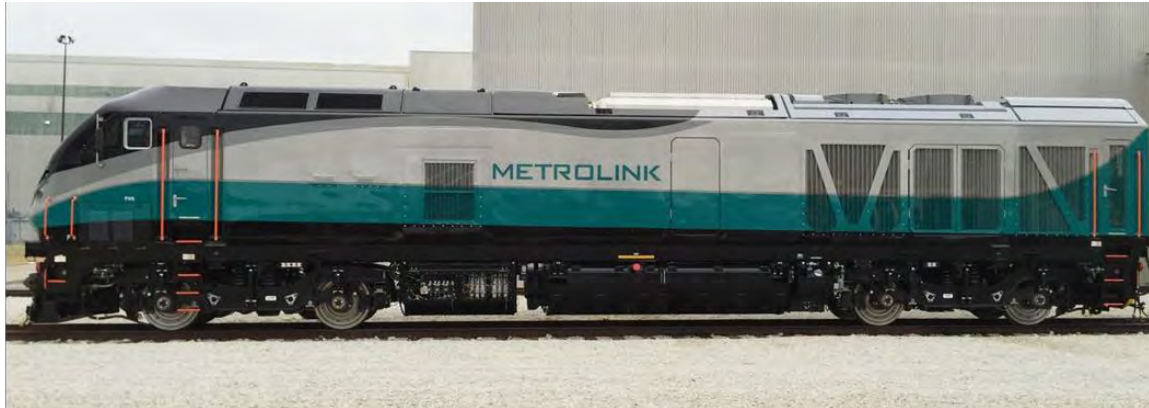
New Tier 4 Metrolink Locomotive

In 2018, Metrolink will operate Tier 4 locomotives only to the Auto Club Speedway race. It will be the first time Tier 4 locomotives will be used to provide service to a Major Event Transportation Center for the Auto Club 400 NASCAR race in March. The MSRC is currently considering co-funding the 2018 race event. As noted in the Final Report, the South Coast Air Quality Management District played a major role with funding for the Tier 4 locomotives.