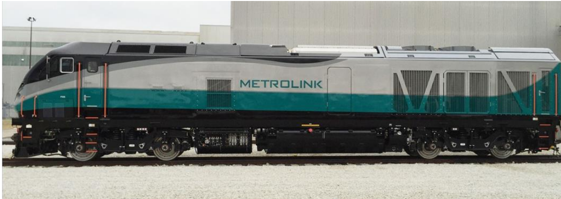
New Tier 4 Metrolink Locomotive

In 2018, Metrolink will operate Tier 4 locomotives only to the Auto Club Speedway race. It will be the first time Tier 4 locomotives will be used to provide service to a Major Event Transportation Center for the Auto Club 400 NASCAR race in March. The MSRC is currently considering co-funding the 2018 race event. As noted in the Final Report, the South Coast Air Quality Management District played a major role with funding for the Tier 4 locomotives.