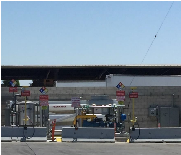
Figure 1: Nasa Compression, Dryer, and Storage Facilities

This new station supports state and local goals to increase petroleum fuel displacement in the region while enhancing air quality by reducing criteria pollutant and greenhouse gas emissions. Below are photographs of the project station. The compression, dryer and storage facilities are depicted below in Figure 1. The time-fill area is depicted below in Figure 2 and the MSRC decal is depicted in Figure 3.