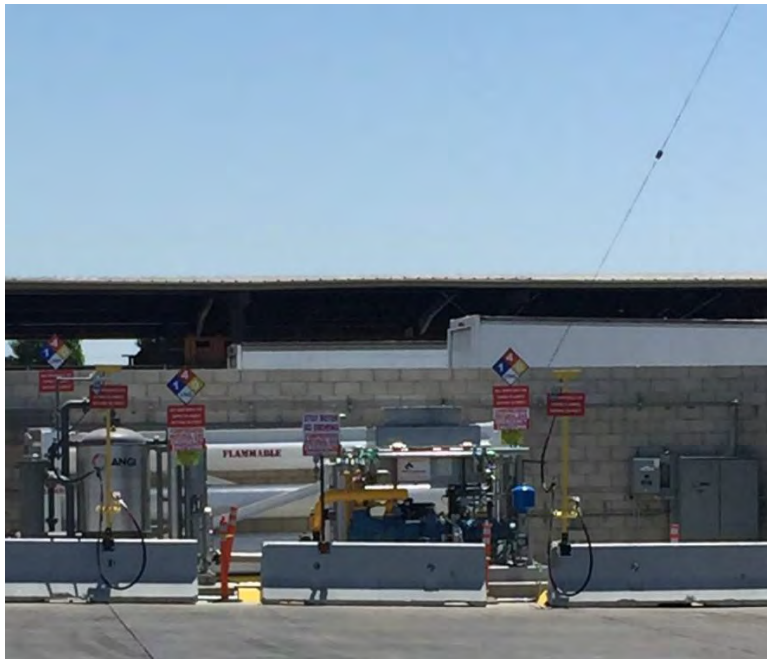
Figure 1: Nasa Compression, Dryer, and Storage Facilities

This new station supports state and local goals to increase petroleum fuel displacement in the region while enhancing air quality by reducing criteria pollutant and greenhouse gas emissions. Below are photographs of the project station. The compression, dryer and storage facilities are depicted below in Figure 1. The time-fill area is depicted below in Figure 2 and the MSRC decal is depicted in Figure 3.