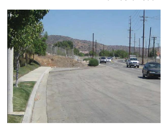
Lambert Road Bike Lanes Project - Before

<u>Lambert Road Bike Lanes Project</u> - The Lambert Road Bikeway Project is located along Lambert Road/Carbon Canyon Road between Sunflower Street and the entrance to Carbon Canyon Regional Park at Santa Fe Road. The project included the construction of a new five-foot wide Class II bikeway in both directions.