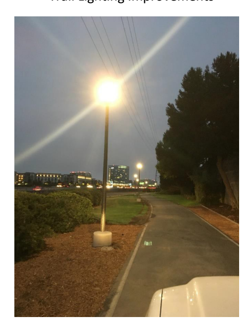
Trail Lighting Improvements

Prior to the implementation of this project there was no bicycle or pedestrian scale lighting within the project location. Although there were existing streetlights along parallel Main Street, the cyclists would have to share the road with vehicles travelling at speeds of up to 50 miles per hour if they chose that route. The project increases visibility and enhances safety.