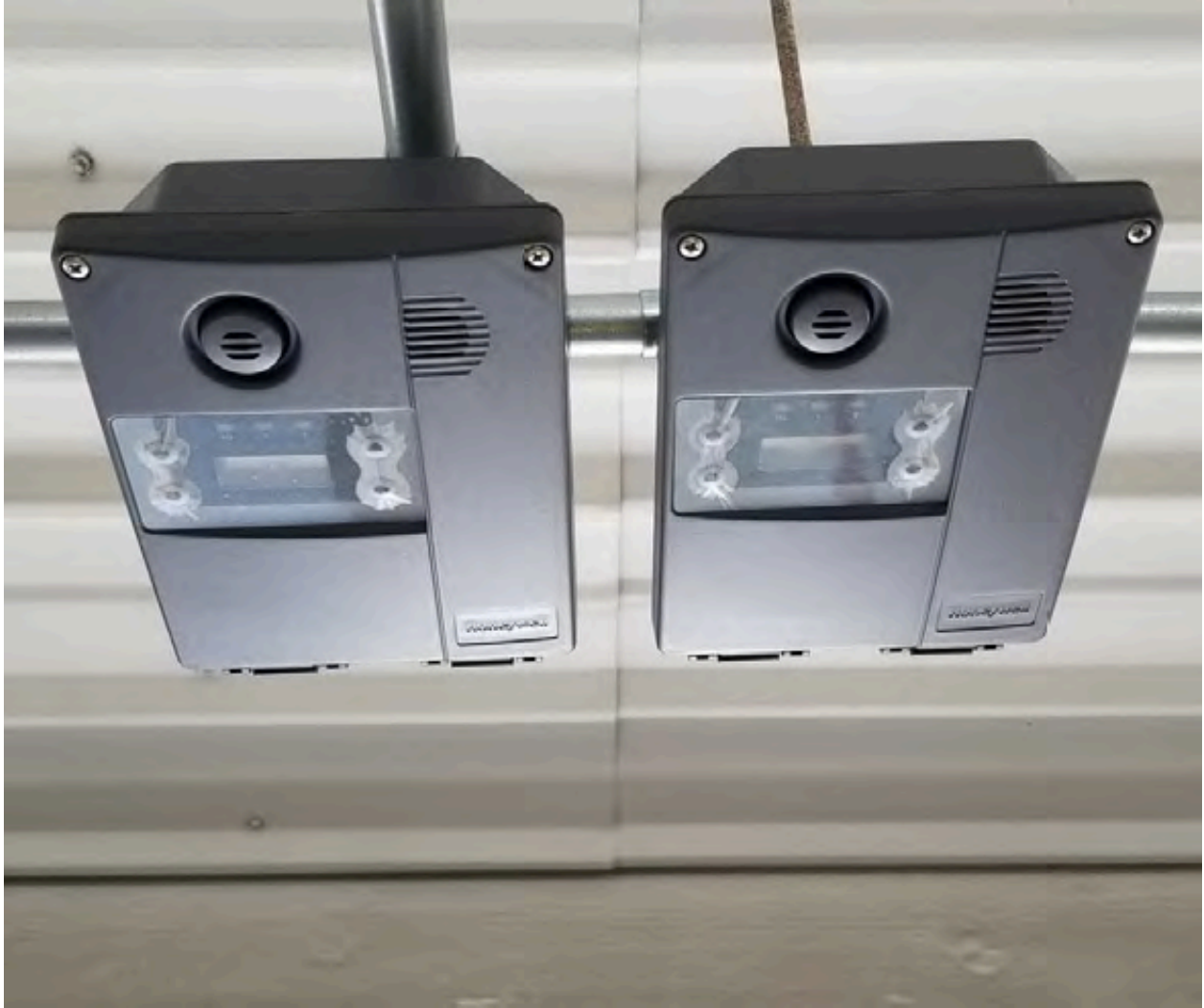
Upgrade Example: Methane Detection System Sensors