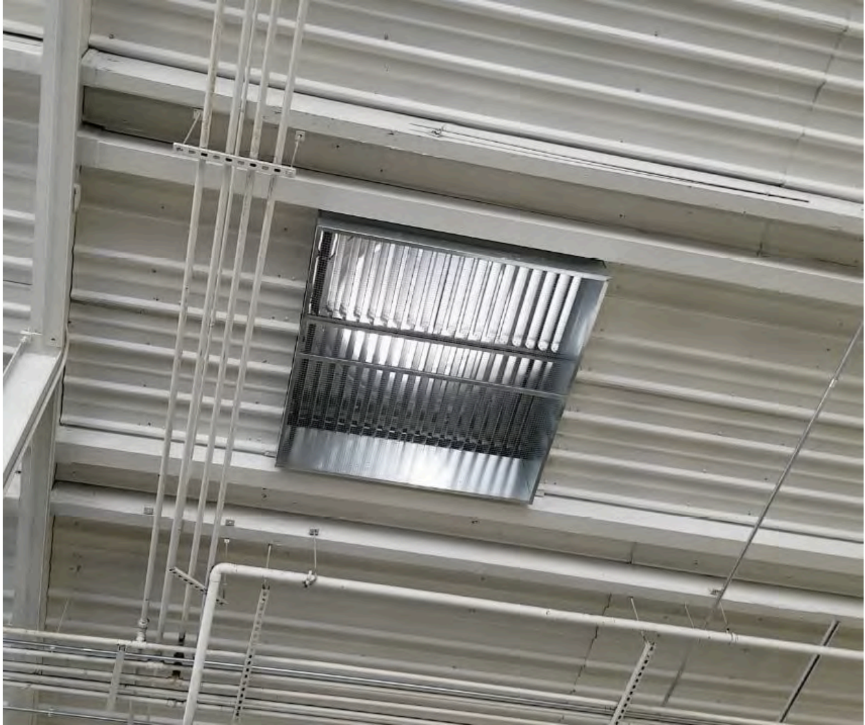
Upgrade Example: Ceiling Exhaust Fan