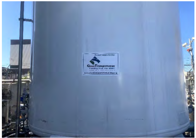
One of two decals showcasing MSRC funding

Because of the delays in application review and contracting from the SCAQMD, the project start date was pushed towards the end of 2019 and as a result suffered delays due to the Covid-19 Pandemic. The station expansion was completed on June 30, 2021.