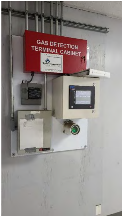
Methane Detection System